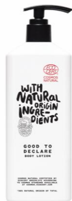
Body Lotion 360ml