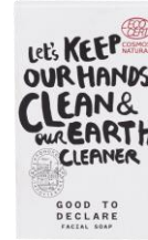
Bar Soap 40g