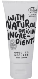
Body Lotion 40ml