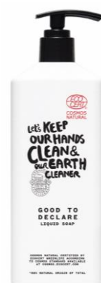
Liquid Soap 360ml