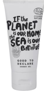
Shower Gel 40ml