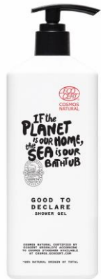
Shower Gel 360ml