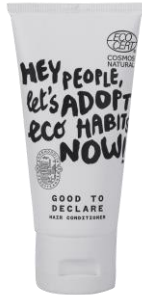
Conditioner 40 ml