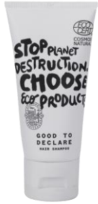
Shampoo 40 ml