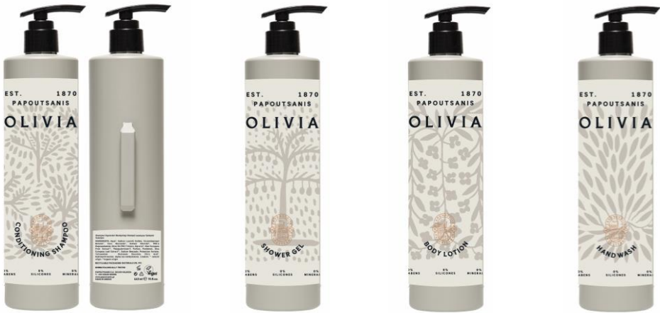
Shampoo 440ml Shower Gel 440ml Body Lotion 440ml Hand Wash 440ml