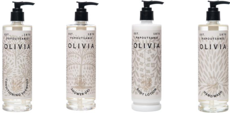
Shampoo 400ml Shower Gel 400ml Body Lotion 400ml Hand Wash 400ml