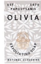
Exfoliating Soap 40g